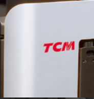
performance silver (only available in the UK)

TCM offers a broad range of options for maximum customisation. Please ask your dealer.